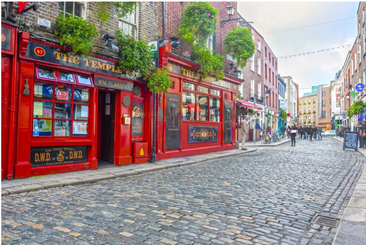
The Temple Bar in Dublin

Embark on a soul-stirring journey across Ireland — from Dublin's lively pubs to the rugged cliffs of the Atlantic coast. Sip your personalized pint at the Guinness